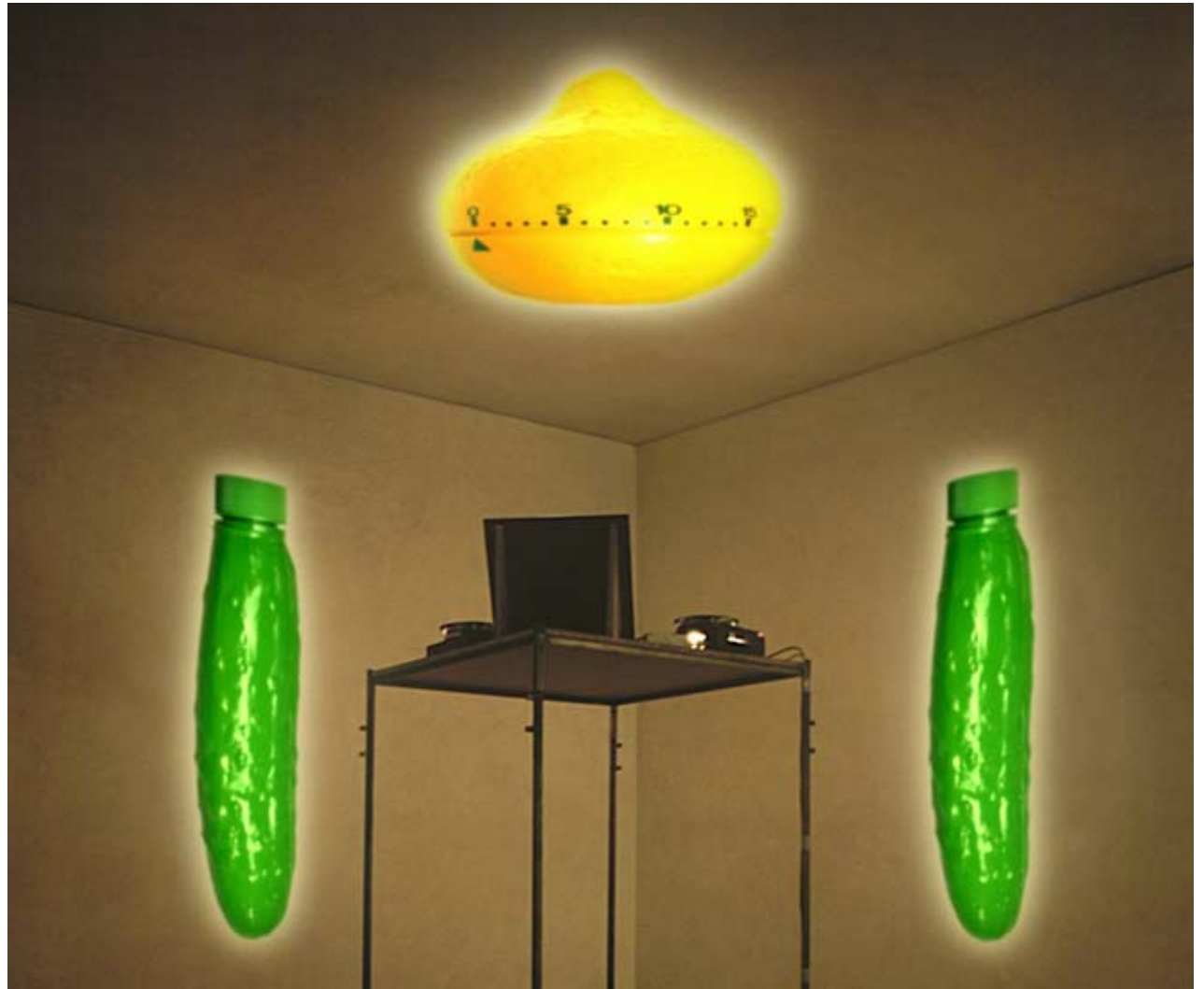
WUNDER, interactive slide installation, installation view Galleria d'Arte Moderna e Contemporanea Bergamo, Italy, 1997