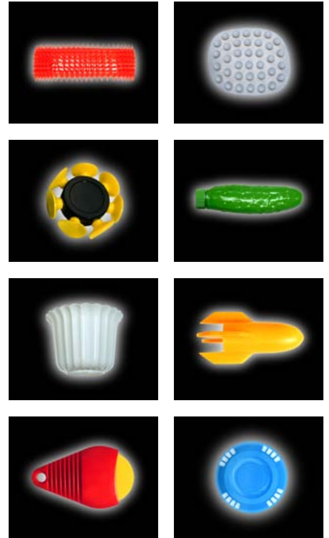
WUNDER, interactive slide installation, selection out of 196 motifs, projection size ca. 2 x 2 m