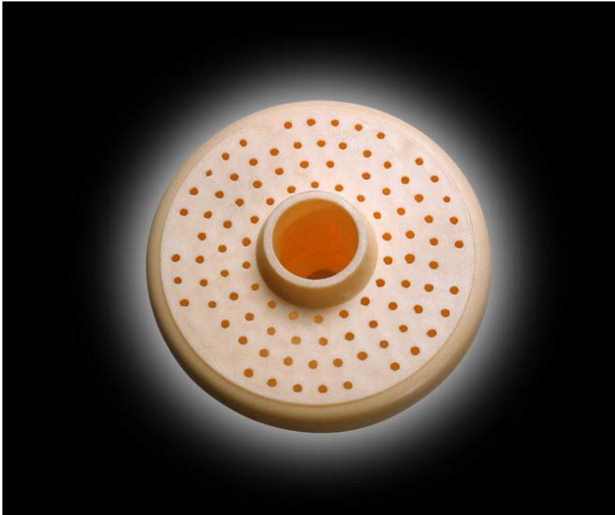
WUNDER, Interactive slide installation, Projection size ca. 2 x 2 m

WUNDER (MIRACLE) is a type of technical apparatus is a wish-machine. Visitors to choose from a range of phrases, all representing human longings, from a touch-screen in the middle of the room. Slides showing the objects corresponding to the activated words are projected large size onto three walls. References are generated by connecting otherwise unconnected images and words. In this way a new perspective on the meaning and content is created. The selection process demands the active, playful participation of the visitor.